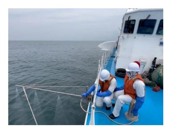
Training of Spraying Oil Dispersants