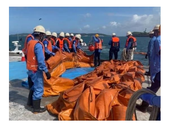
Training of Deployment Oil Booms