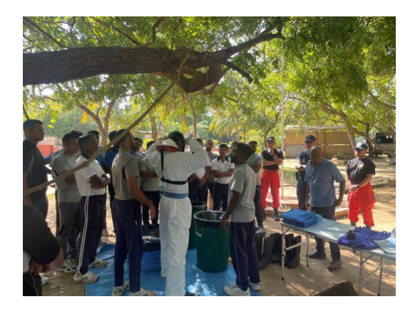
Training of Putting on and Taking off Personal Protective Equipment