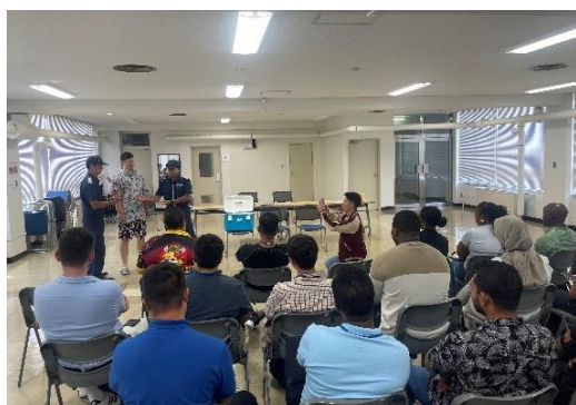
Lecture with Demonstration on Illegal Fishing Enforcement