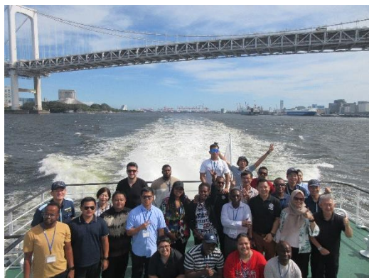
Observation of Tokyo Bay