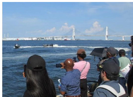
Demonstration of Small Boat Interdiction