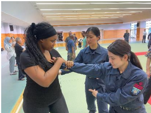
Arresting Technique Training

Japan Coast Guard will contribute to the maintenance of a rule-based international order, the peace and safety of the seas while enhancing collaboration with those overseas agencies through continuing support for capacity building of maritime law enforcement.