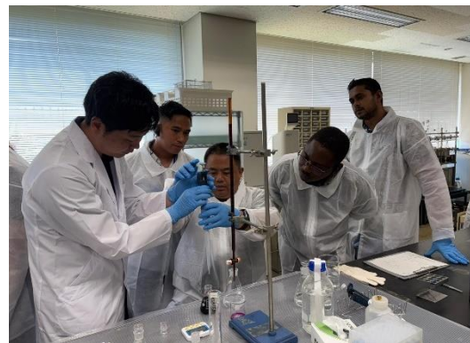
Water Sampling and Analysis Practicum