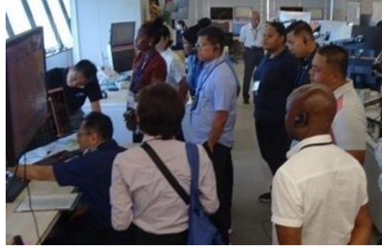
Visit to Kanmon Strait VTS Center