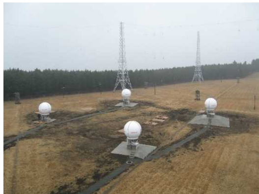
MEOLUT (Futtsu in Chiba: 6 Channels)