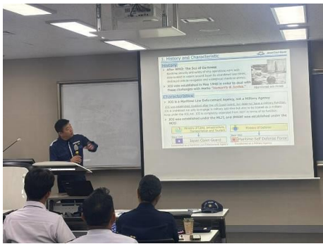
<Overview of JCG>