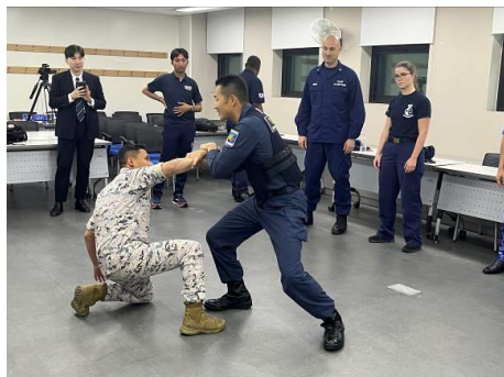
<Training: Arresting techniques>