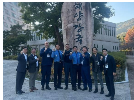
<three CGs Instructors>

※These images can be provided. Please contact Policy Evaluation and Public Relations Office, Administration Department, JCG HQ jcgh-koho-6b3c@ki.mlit.go.jp , if you need the image of events.