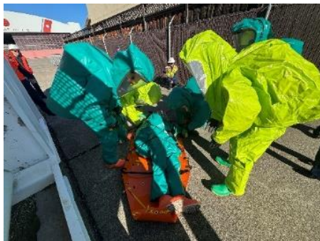
The joint HNS response training between the NSF and the NST