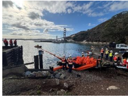
Oil boom deployment at USCG Station Golden Gate