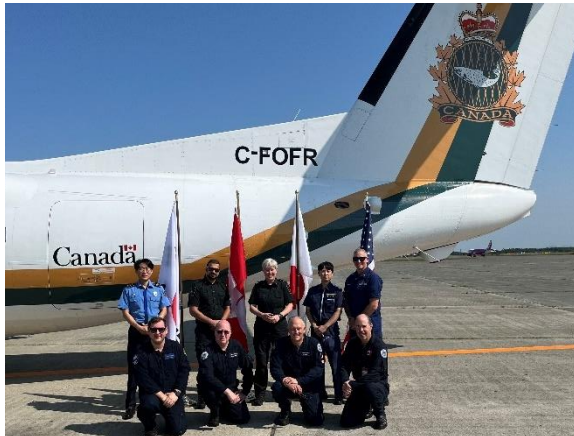
Group photo of participating countries (Back row, from left: KCG, DFO, JCG, USCG) * USCG participated in patrol the day before.