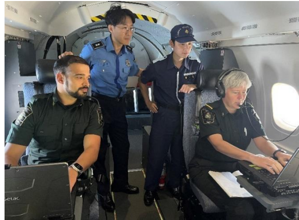
Observer Participation (First row: DFO officers, Upper left: KCG officer, right: JCG Officer)