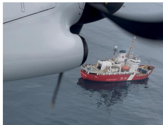
Canadian Coast Guard icebreaker “Sir Wilfrid Laurier” during a surveillance operation at sea.