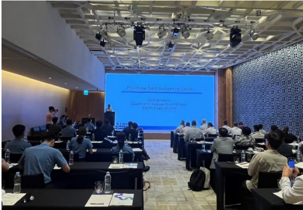
<Japan, the U.S. and Korea joint seminar>