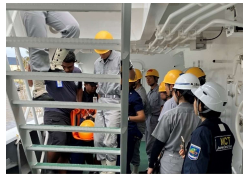
Joint Training in Patient Transport