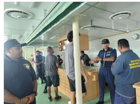
Training vessel 「JTSUKUSHIMA」 tour