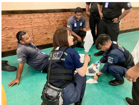
First Aid Training for Fractures