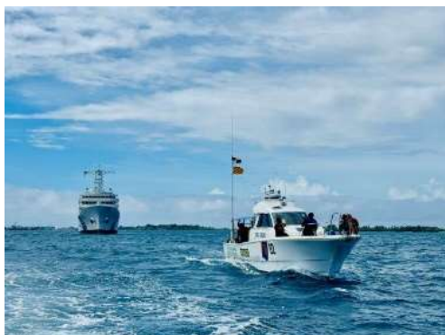
Navigation & VHF Exercise by using vessels