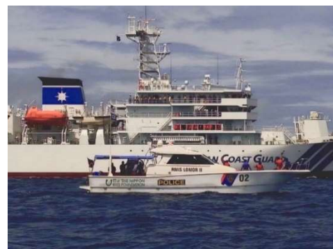
Departure from Marshall Farewell each other