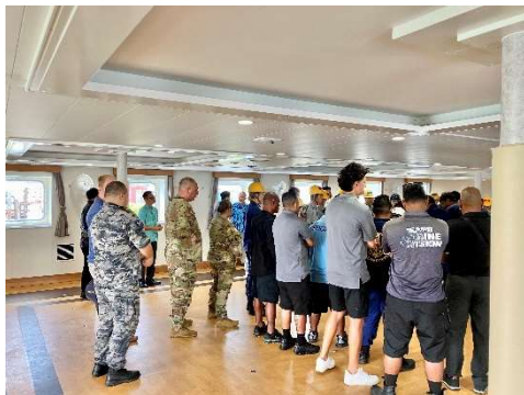
Observation by RMI, U.S., AUS government representatives.