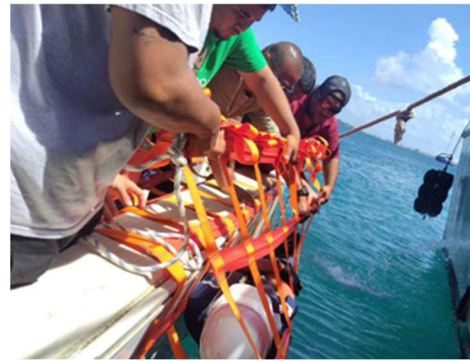
Rescue Training for Persons Adrift